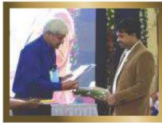
RECOGNIZED IN VARIOUS INTERNATIONAL CONFERENCES