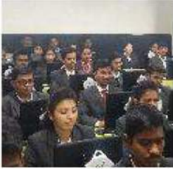
200+ Computer Labs