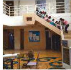
Hostel & Food Facility