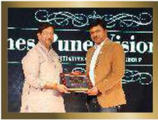
TIMES VISIONARY AWARD