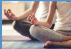
Meditation & Spirituality