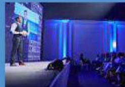
Communication & Soft Skills