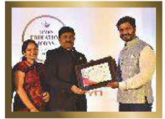
TIMES EDUCATION ICON AWARD