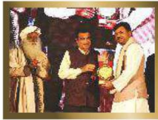
AWARD BY MAHARASHTRA JOURNALIST ASSOCIATION