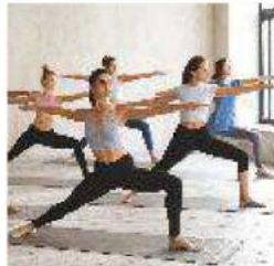
Work-out, Zumba, Aerobics