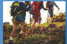
Adventures & Treks