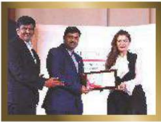
TIMES INNOVATIVE COURSE IN COMMERCE AWARD