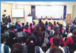
Industry Experts' Seminars